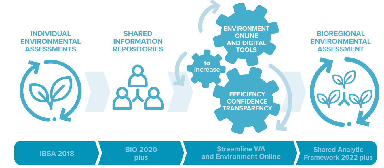
FIGURE 1 The transformation pathway to digital assessment at a bioregional scale

These initiatives place Western Australia in a good position to continue to transform its environmental assessment processes into a contemporary digital approach: Digital EIA (see Figure 1).